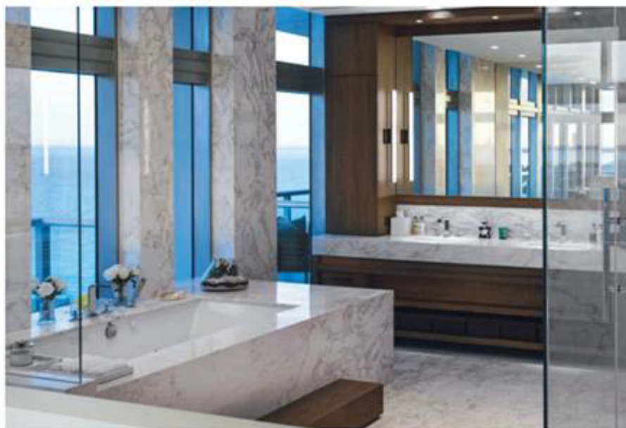
This bathroom, designed by Dunagan Diverio Design Group, is featured in "Surface Study."