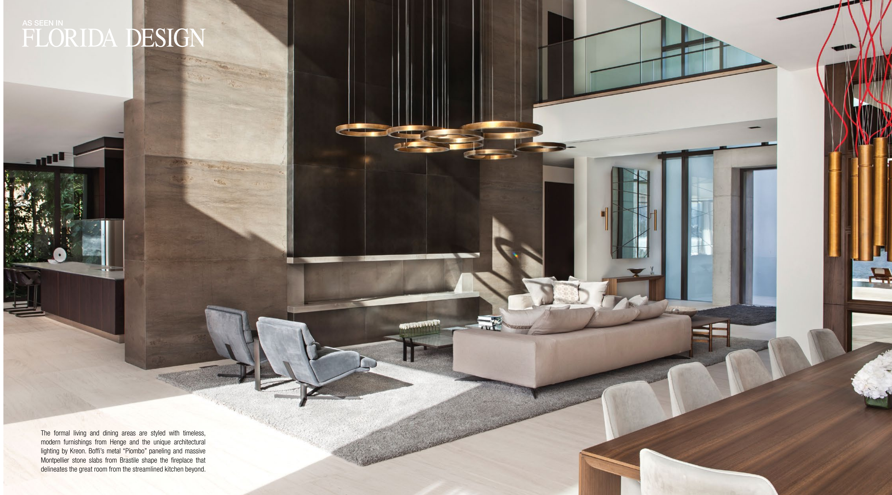
The formal living and dining areas are styled with timeless, modern furnishings from Henge and the unique architectural lighting by Kreon. Boffi's metal "Piombo" paneling and massive Montpellier stone slabs from Brastile shape the fireplace that delineates the great room from the streamlined kitchen beyond.