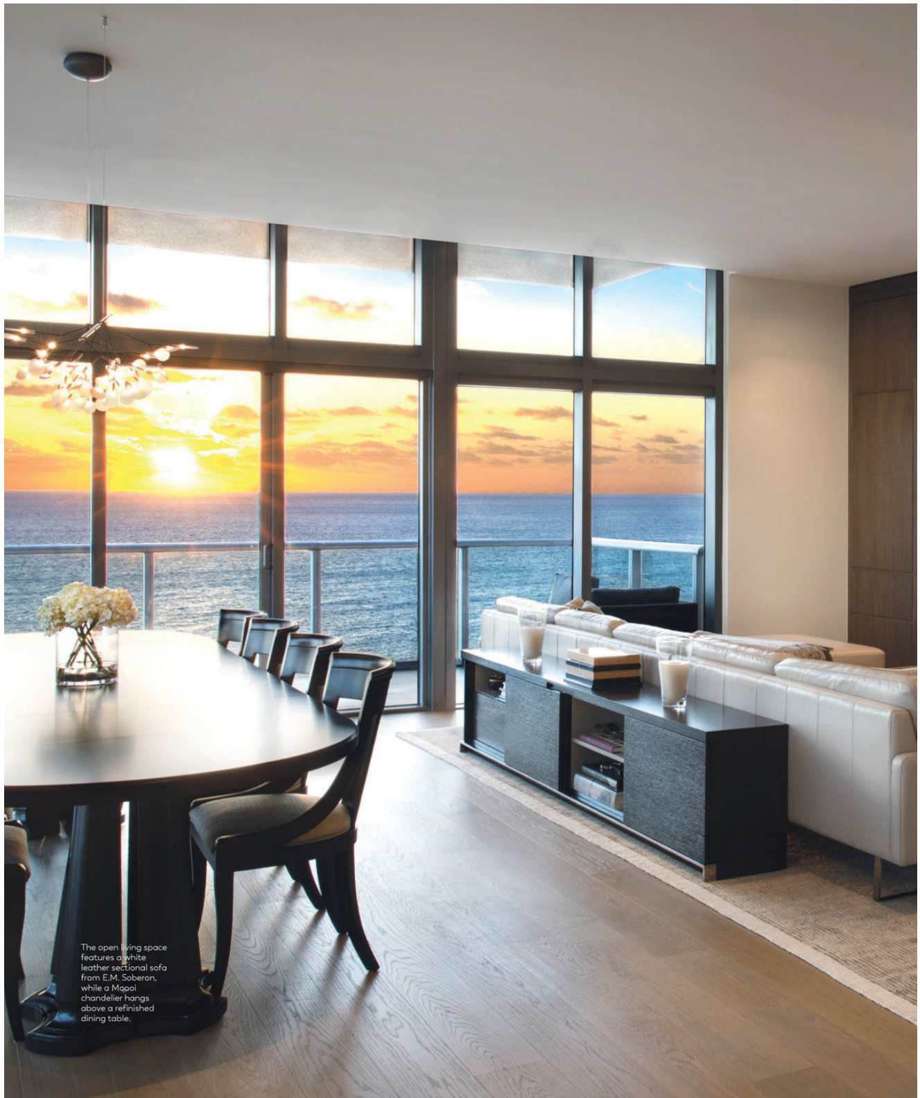
The open living space features a white leather sectional sofa from E.M. Soberon, while a Moooi chandelier hangs above a refinished dining table.