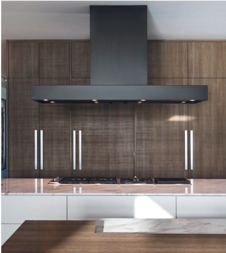
From left: The open-style Sub-Zero kitchen; pale walls and neutral oak floors allow the couple's art collection to command attention. Opposite page: Passageways are covered in oak millwork and arresting art, such as the wife captured in a triptych—in a series of dynamic moves.