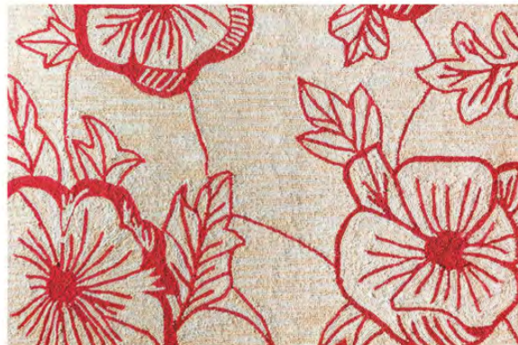
1 Roche-Bobois' Nonette lamp ($1,695, roche-bobois.com) 2 Kakar House of Design's cotton and wool Bold Coral Floral rug ($899, kakarhouseofdesign.com) 3 Embryo chair from Cappellini ($4,394, luminaire.com) 4 Artefacto's Constantin bedside table, with drawers lined in Suede Madri Paprika ($6,500, artefacto.com) 5 Shiro Kuramata's 20-drawer revolving cabinet dates from 1970 ($3,029, luminaire.com).