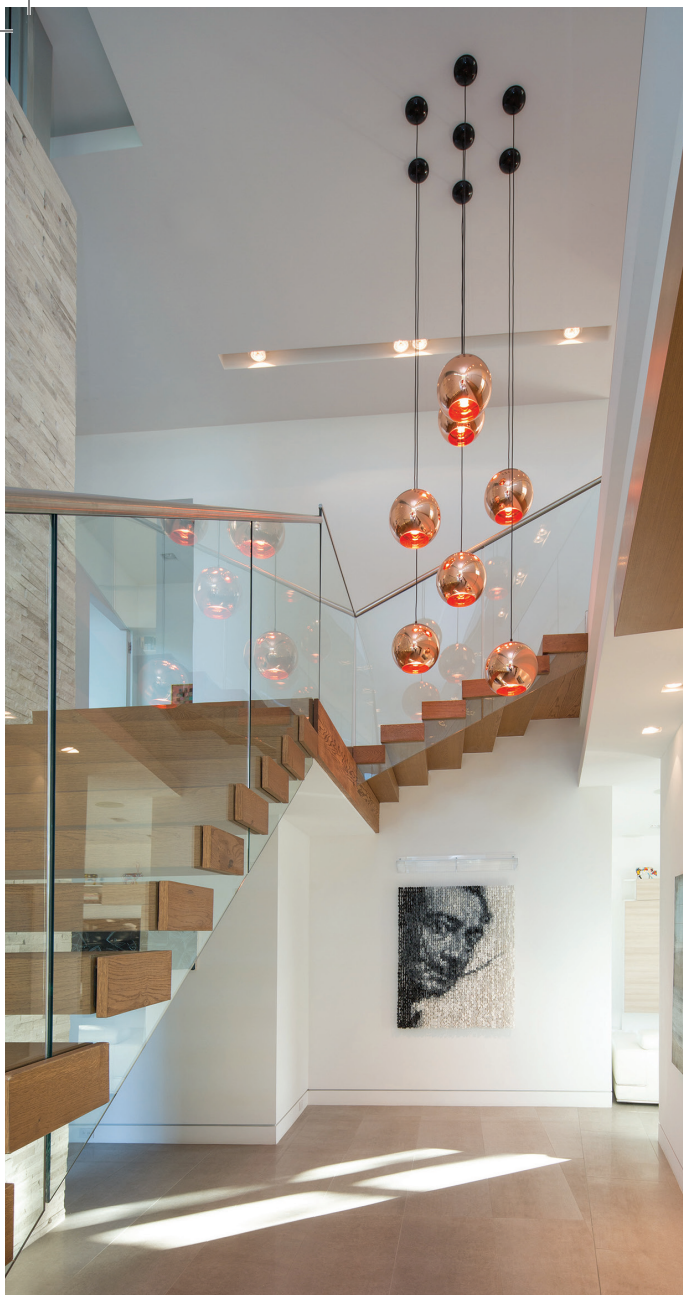
Hanging copper lights by Tom Dixon give dimension to the stairwell.