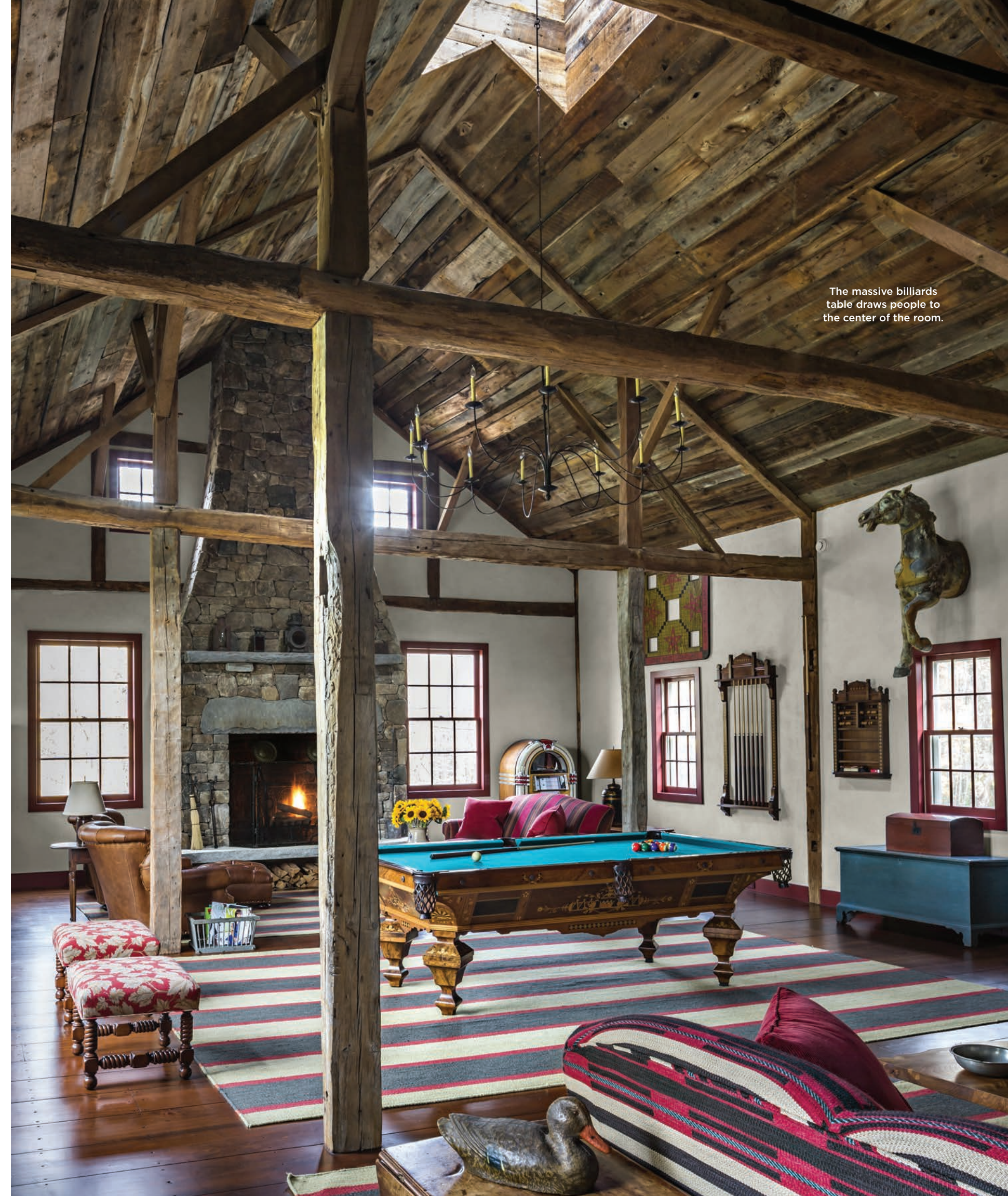
The massive billiards table draws people to the center of the room.