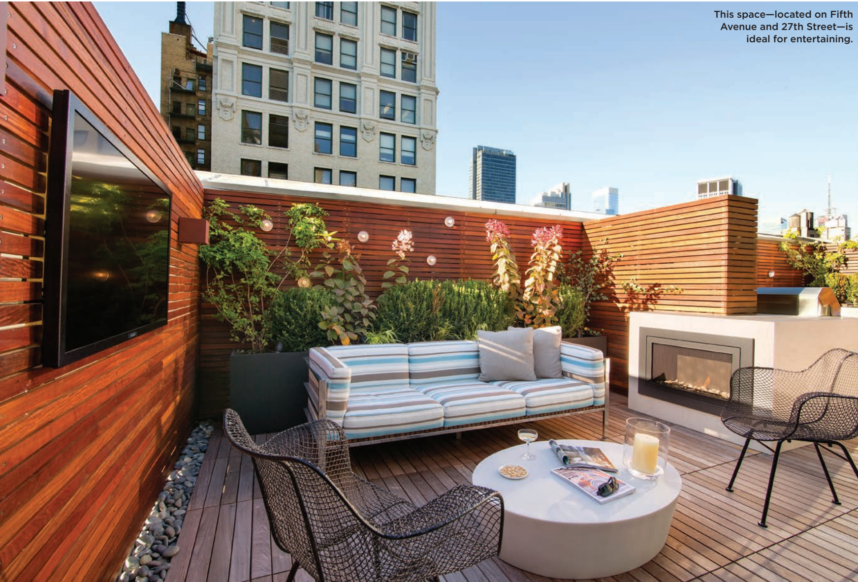
This space—located on Fifth Avenue and 27th Street—is ideal for entertaining.