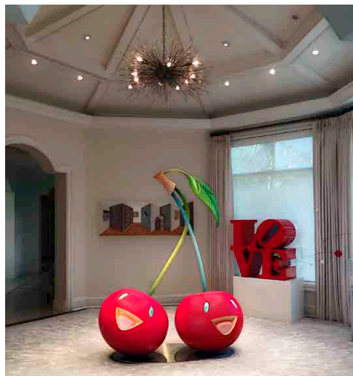
IMAGE MAKER: One Inspired Designer Becomes A Passionate Force By Creating Art In Harmonious Interiors

Question: What sparked your passion for the world of interior design?