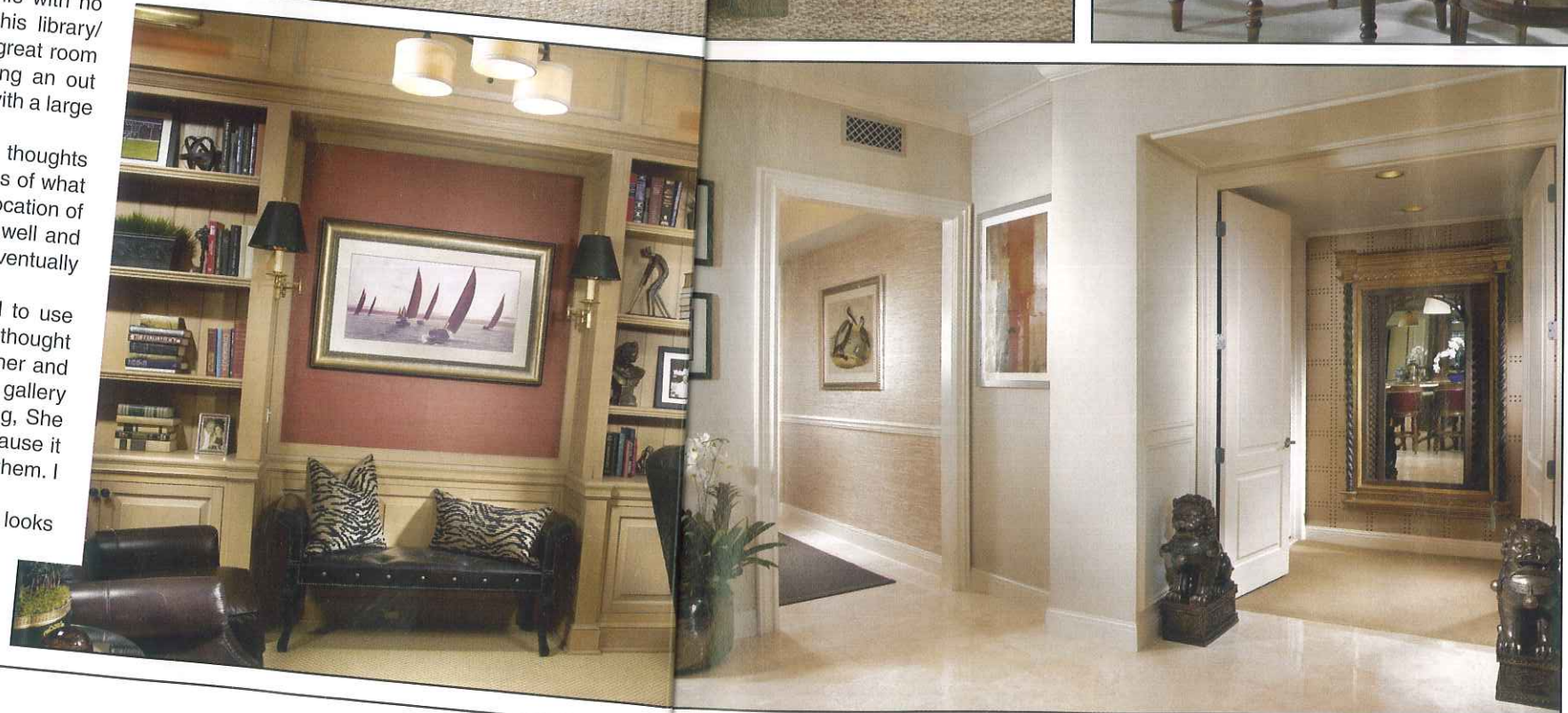
Clockwise: The design mixes high and low — the Ralph Lauren pendants in the kitchen and a Z Gallerie mirror in the dining room. Mike Conville, a builder, created the bar with TV inserted into a two-way mirror, bookcases in the library and a built out casing to add architectural detail.